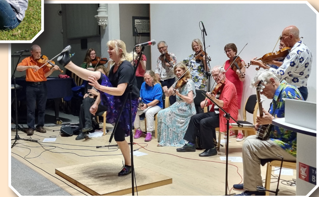
Fringe Week 19th – 26th July 2026

Enjoy an amazing week full of arts, sports, and cultural activities during this year's Fringe Week . From live music to art in the market, there is something for everyone – look out for the Fringe brochure dropping through your door in June.