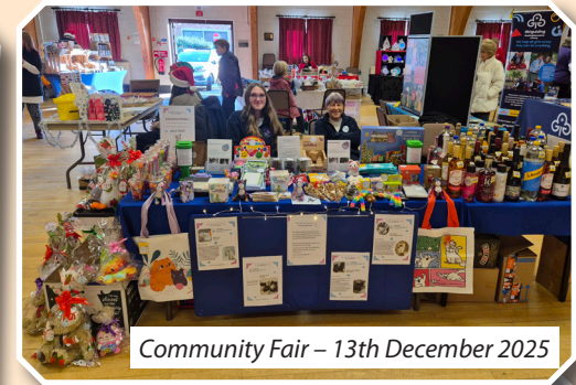
Community Fair – 13th December 2025