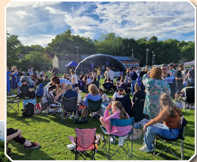
Buckingham Live – 24th May 2026

Dance the day away on 24th May! Enjoy Buckingham Live with music and family fun on the green outside Buckingham Football Club clubhouse. Bring along a picnic or treat yourself to some delicious food from one of the food stalls. A licensed bar will be available in the clubhouse.