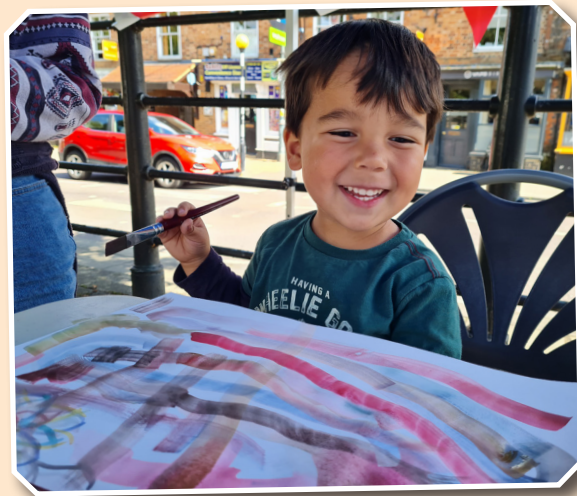
Green and Crafts – 12th April 2026

Looking for something to do in the Easter holidays? Come and join us for Green and Crafts in the Cattle Pens for a day of free eco-friendly, sustainable crafting on Sunday, 12th April. Paint a picture or let your imagination run wild and create something unique from natural and recycled materials.