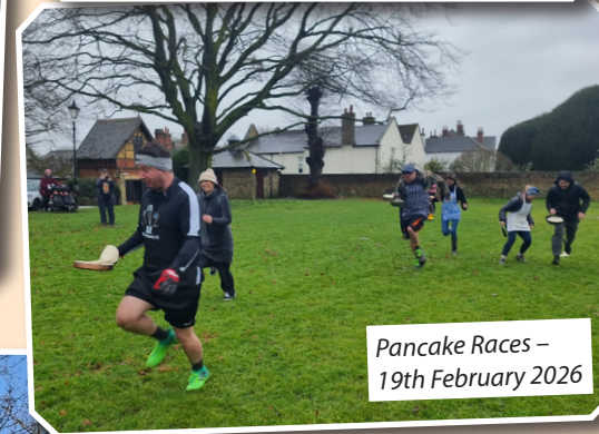
Pancake Races – 19th February 2026