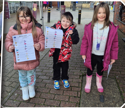
Small Business Saturday – 6th December 2025