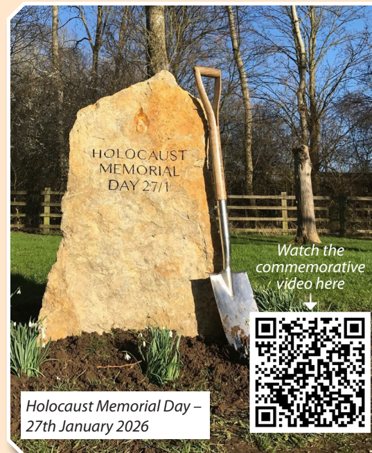
Holocaust Memorial Day – 27th January 2026