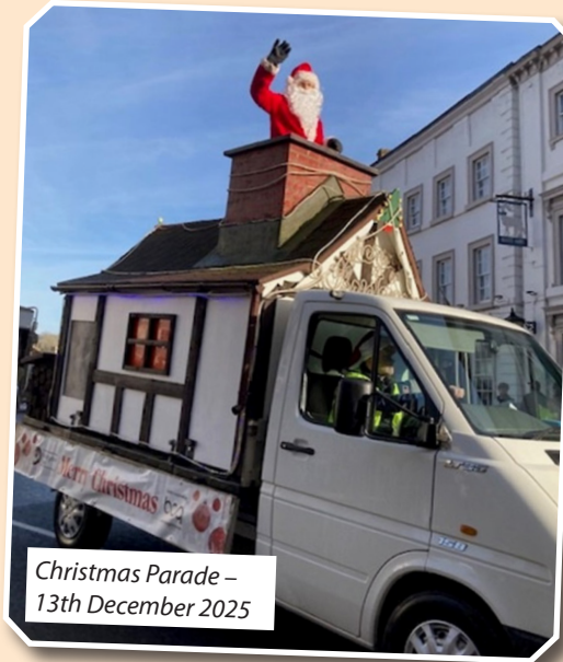
Christmas Parade – 13th December 2025