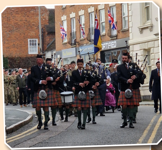
Remembrance Parade – 9th November 2025