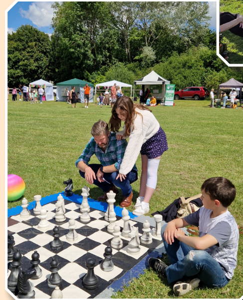
Celebrate Buckingham Day – 20th June 2026

Celebrate Buckingham Day on Saturday, 20th June is a relaxed community event held in the Paddock at Bourton Park. Join us to celebrate some of Buckingham's vibrant voluntary, community and non-profit organisations. A perfect family day out with food stalls, ice creams, free crafts and games.