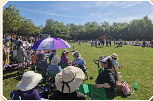
May Day – 1st May 2026

Join us for May Day on Friday, 1st May to see the wonderful maypole dancing by local schoolchildren. Follow our social media pages for up to date information about this and all of our other events.