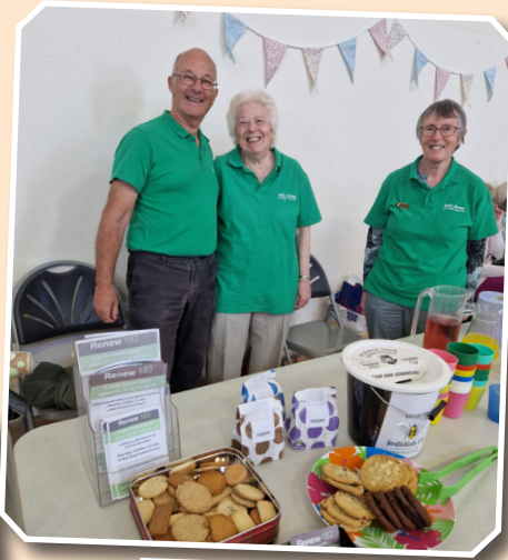
Easter Fair – 29th March 2026

The popular Lace Hill Easter Fair will take place on Sunday 29th March. There will be Easter themed crafts for the children and lovely stalls to browse, with an array of handmade products and tasty treats from local organisations and makers. Refreshments will be available too. A perfect afternoon out for families.