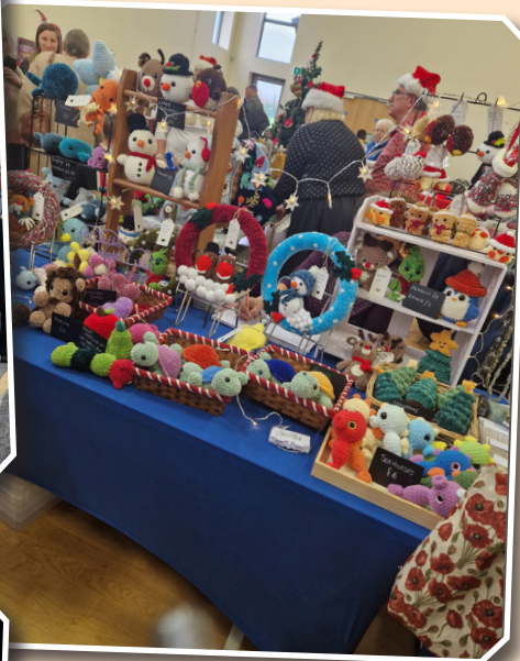
Winter Fair – 16th November 2025