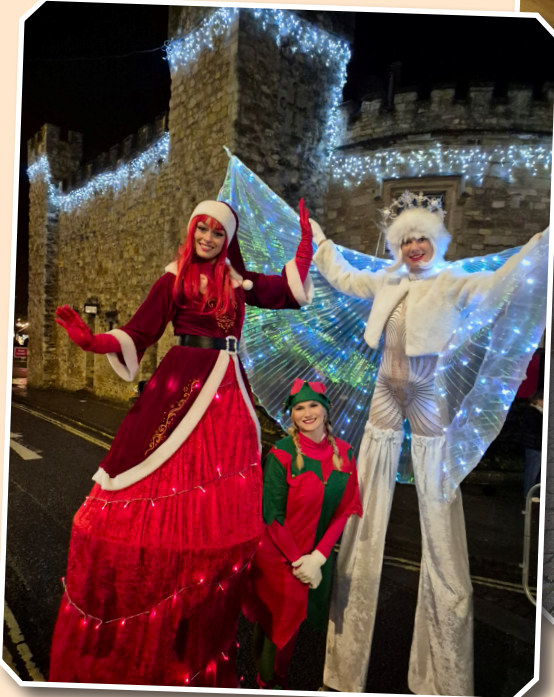
Christmas Lights Switch On – 17th November 2025