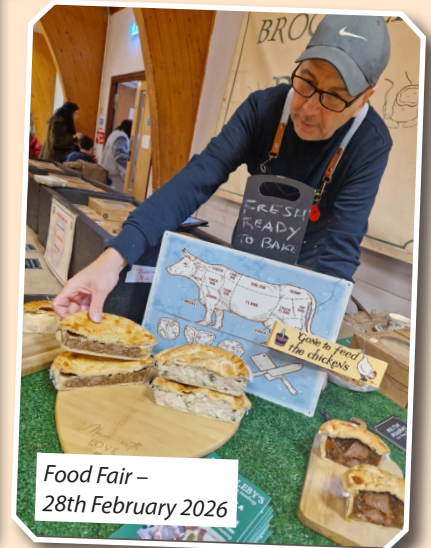
Food Fair – 28th February 2026