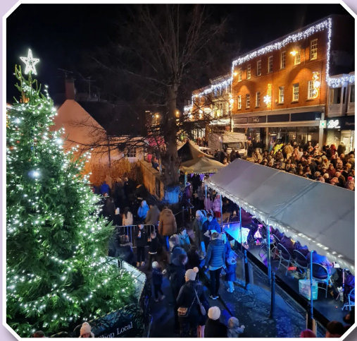
Christmas Lights Switch On: 27th November 2025

The Christmas Lights Switch On will be taking place on Thursday 27th November 2025 from 4pm to 7pm outside The Old Gaol. Expect carols, festive activities, local food vendors and live entertainment.