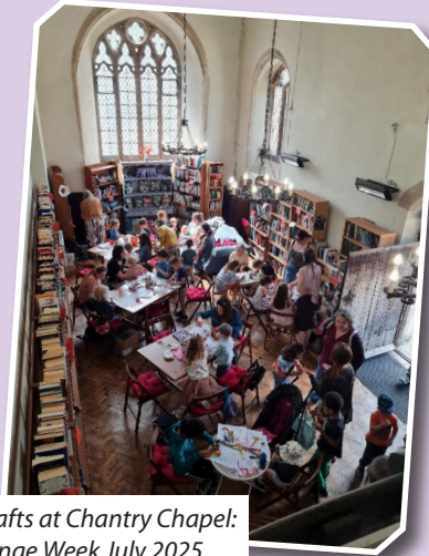
Crafts at Chantry Chapel: Fringe Week July 2025