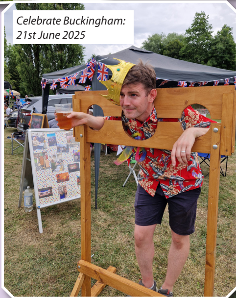
Celebrate Buckingham: 21st June 2025