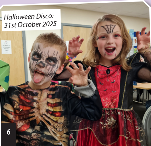
Halloween Disco: 31st October 2025

Join us at Lace Hill Sports & Community Centre for a fantastic family friendly Halloween Disco Party on Friday 31st October 2025 from 6-9pm. Tickets can be purchased from Buckingham Tourist Information Centre.