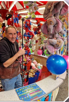
Charter Fairs: 18th and 25th October 2025

This year the annual Charter Fair rolls into town on Friday 17th October 2025 to set up and will be operating on Saturday 18th October 2025. It will then return on the following Friday, 24th October 2025 and will operate on Saturday 25th October 2025. A full road closure will be in force from 6am on both Fridays and covering both Saturdays. Diversions will be in place.