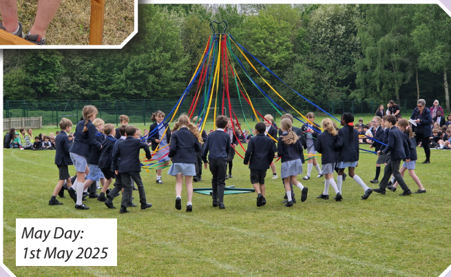
May Day: 1st May 2025