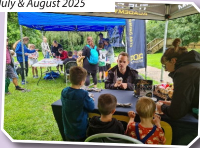
Buckingham Play Days: July & August 2025