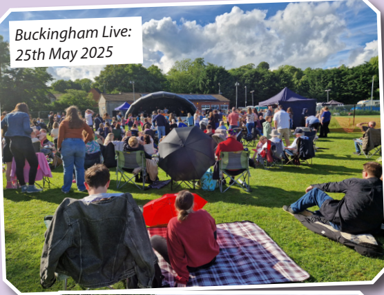
Buckingham Live: 25th May 2025