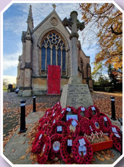
Remembrance Parade: 9th November 2025

Buckingham's Remembrance Parade will be held on Sunday 9th November 2025. The parade will form up on Market Hill and march to the War Memorial outside St Peter and St Paul Church at 10:30am. A rolling road closure and diversions will be in place from 10:15am.