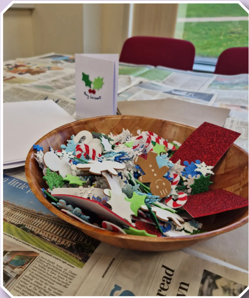
Winter Fair: 16th November 2025

The Winter Fair will take place on Sunday 16th November 2025 from 2pm–4pm at Lace Hill Sports & Community Centre. There will be lots of local handmade Christmas goodies, refreshments and art and craft activities for the children to enjoy.