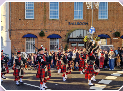
Christmas Parade: 13th December 2025

The annual Christmas Parade will be on Saturday 13th December 2025 and is organised by the Christmas Parade Committee. The Parade is made up of floats and walking groups.