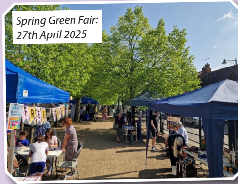
Spring Green Fair: 27th April 2025