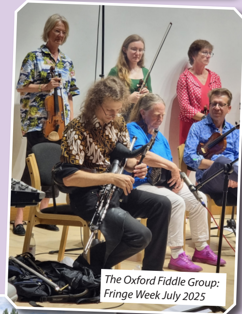
The Oxford Fiddle Group: Fringe Week July 2025