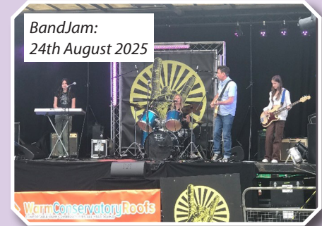
BandJam: 24th August 2025