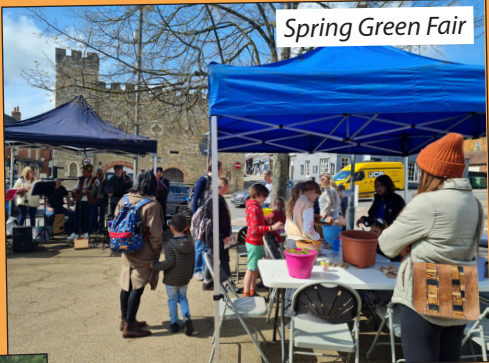
Spring Green Fair