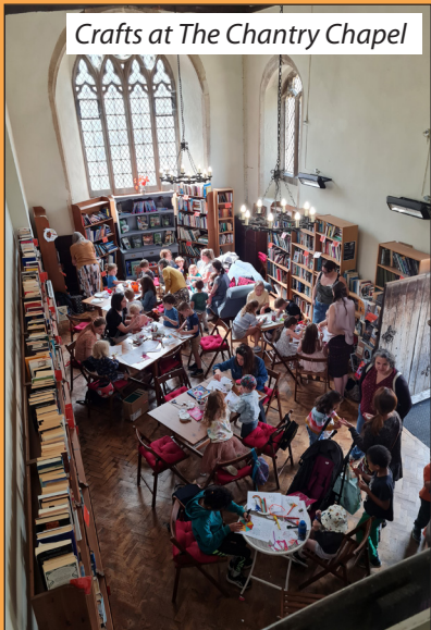
Crafts at The Chantry Chapel