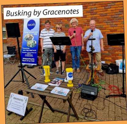
Busking by Gracenotes