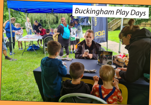
Buckingham Play Days