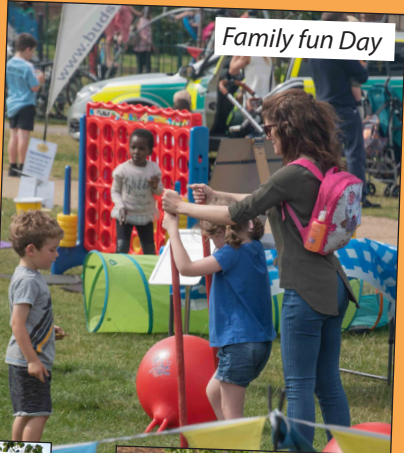
Family fun Day