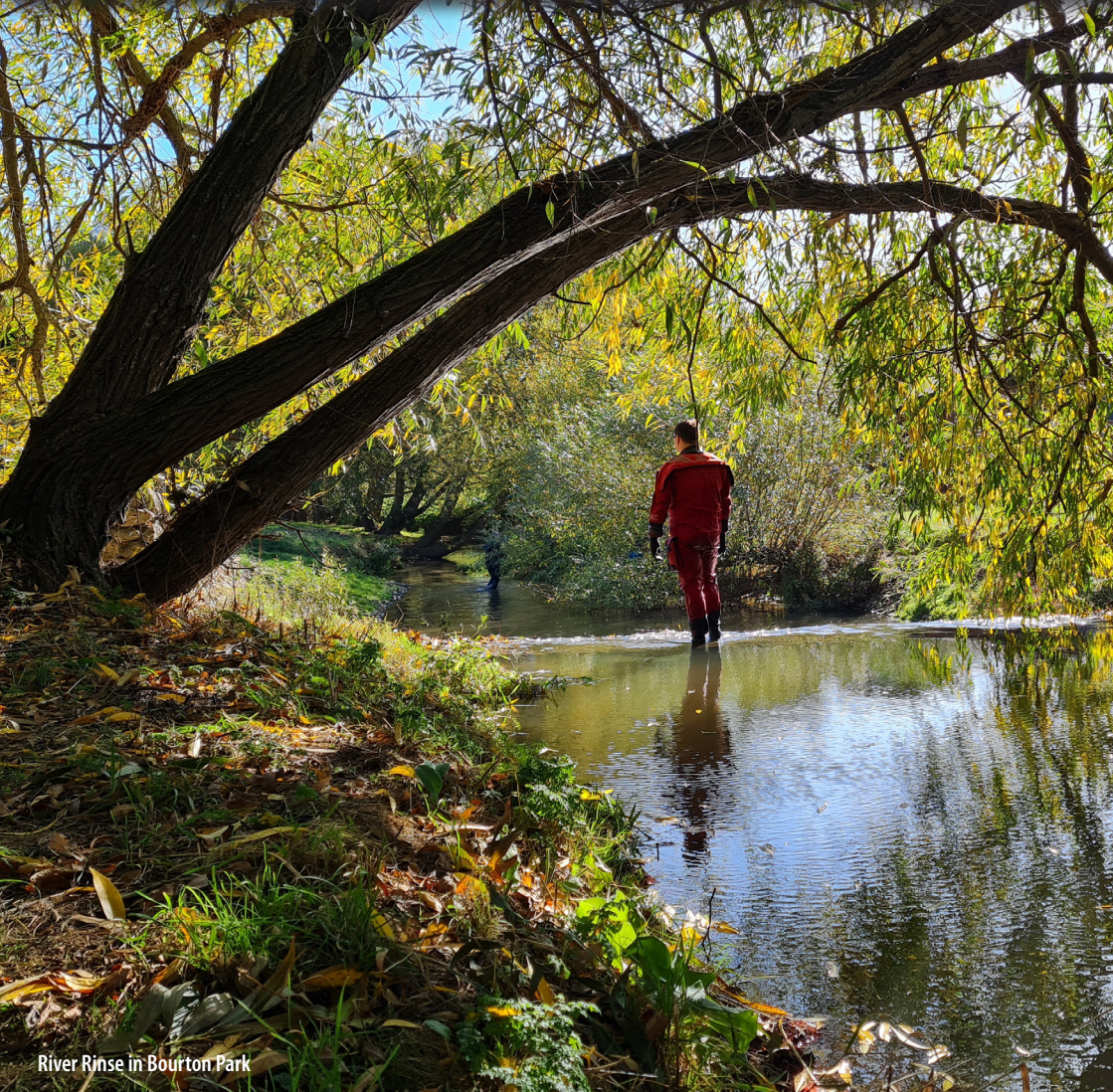
River Rinse in Bourton Park

Message from your Mayor • Grass cutting • Civic awards • Future Events