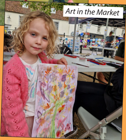
Art in the Market