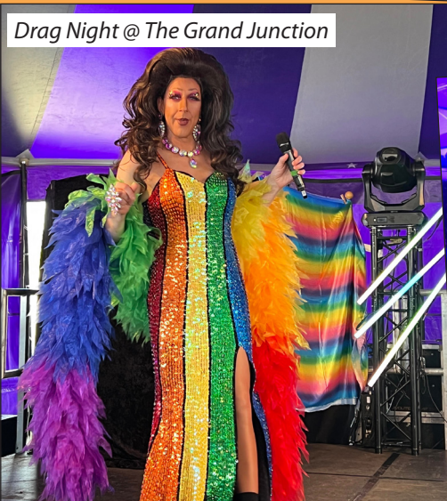
Drag Night @ The Grand Junction