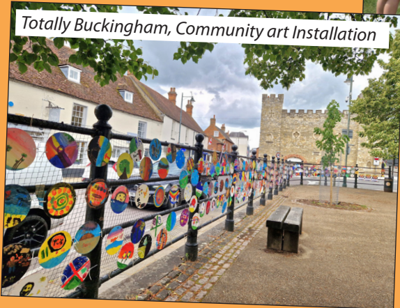
Totally Buckingham, Community art Installation