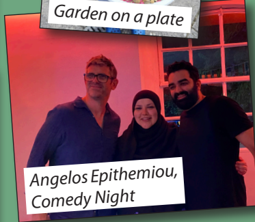
Angelos Epithemiou, Comedy Night