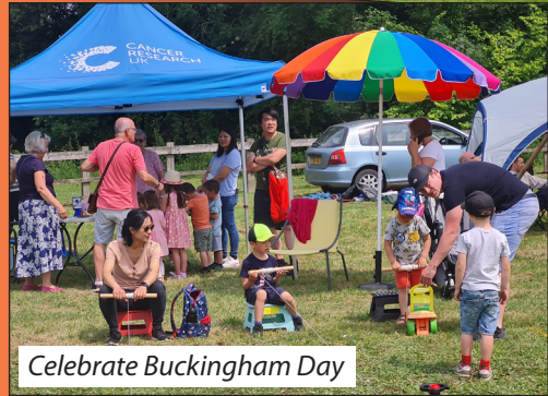
Celebrate Buckingham Day