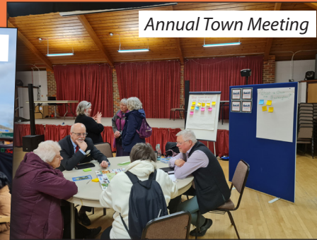
Annual Town Meeting