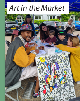
Art in the Market