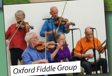
Oxford Fiddle Group