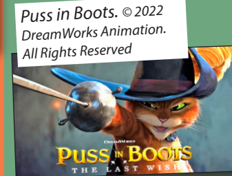
Puss in Boots. © 2022 DreamWorks Animation. All Rights Reserved