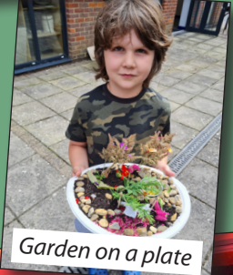
Garden on a plate