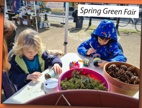
Spring Green Fair