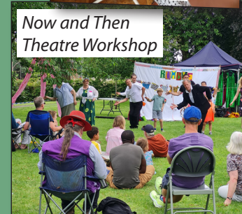
Now and Then Theatre Workshop