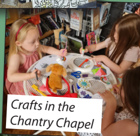
Crafts in the Chantry Chapel