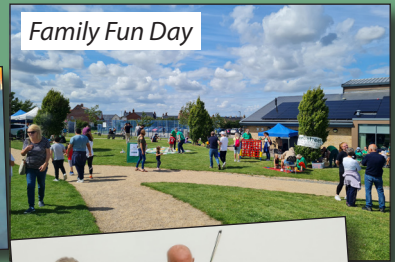
Family Fun Day