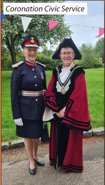
Coronation Civic Service