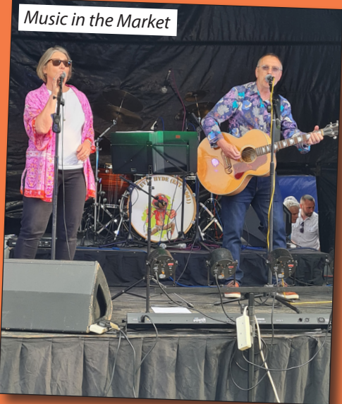
Music in the Market