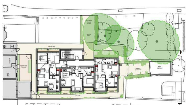
Previous ground floor plan