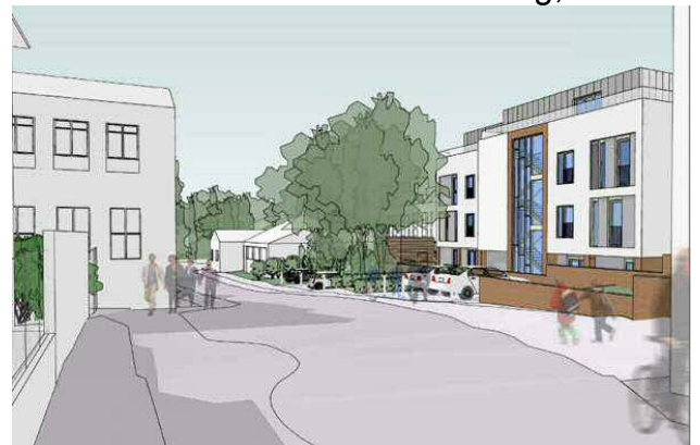
Previous application, Verney Close elevation

The building proposed was four storeys high, had three one-bedroom flats on each of the lower floors, with a two-bedroom flat on the top floor and a flat roof at the same height as that of the flats in the Bank building; there was no lift, and no parking.