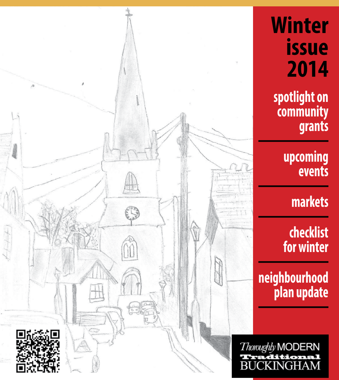
Illustration – Holly Borthwick