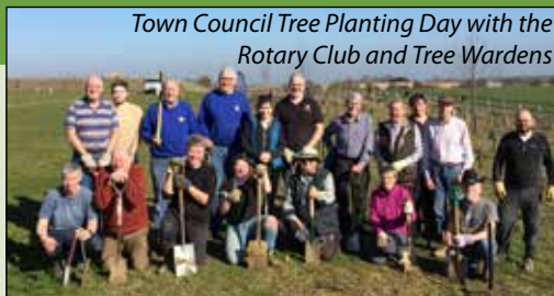
Town Council Tree Planting Day with the Rotary Club and Tree Wardens

Currently six of our tree wardens are looking after sapling trees from the Woodland Trust; once these have grown larger they will