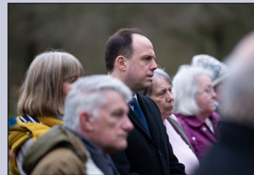
Greg Smith, MP for Buckingham