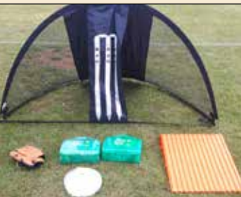
This sports kit was purchased by one of our 2019/2020 grant recipients!

Grants are available to any local, non-commercial group that runs or intends to run a project or activity beneficial to the people of Buckingham. This year, 19 groups applied