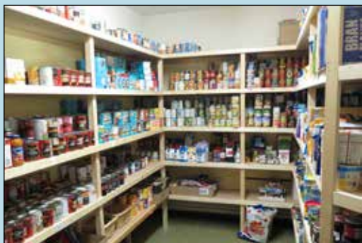
Part of the food bank

Buckingham Food Bank provides an emergency food parcel for those in crisis and in urgent need of food. Such a crisis can arise for a number of reasons including benefits delays, housing loss, family breakdown, debt and redundancy.