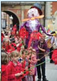
The Roadl Dahl Festival parade 2014

Spaces are very limited and can be booked through Buckingham Tourist Information Centre, Old Gaol, Market Hill, Buckingham MK18 1JX