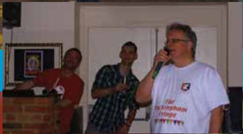
Top: Ghost Walk Right: Karaoke Night Bottom: Oxford Fiddle Group